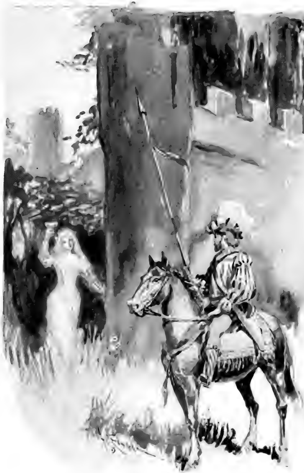
"THE BEAKER HIGH IN HER HAND. —Page 138.